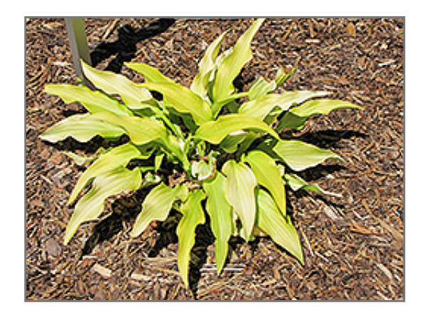
Hadspen Sapphire Hosta