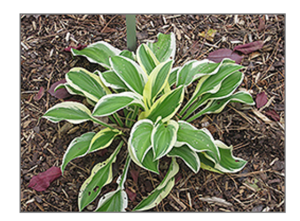
Iron Gate Delight Hosta