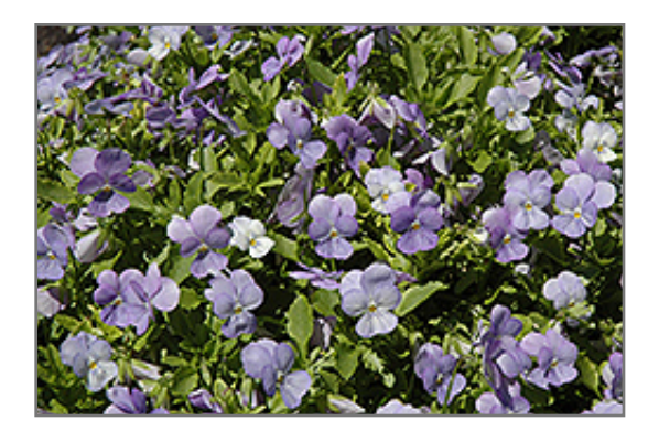
Endurio Sky Blue Martien Pansy flowers