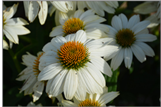
PowWow White Coneflower flowers

PowWow White Coneflower is recommended for the following landscape applications;