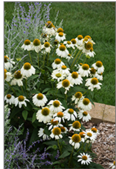
PowWow White Coneflower in bloom