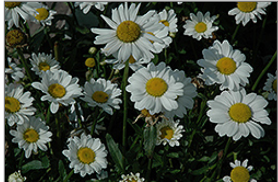
May Queen Shasta Daisy flowers

May Queen Shasta Daisy is recommended for the following landscape applications;