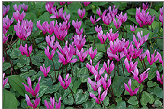
Purple Cyclamen in bloom