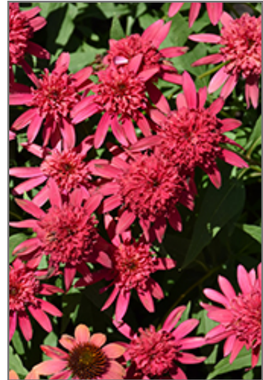
Double Scoop Raspberry Coneflower flowers