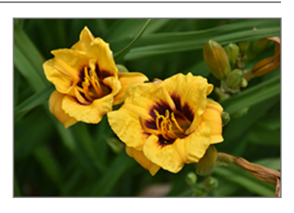
Lightning Bug Daylily flowers