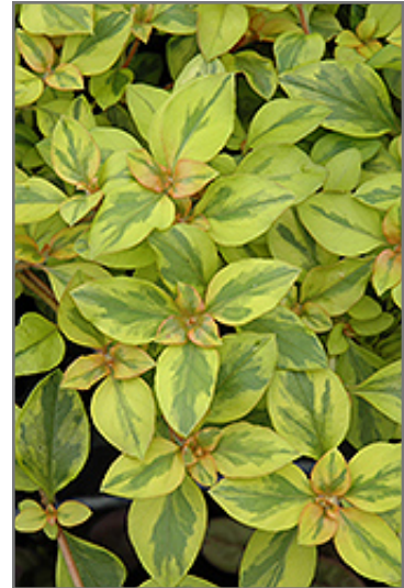
Walkabout Sunset Loosestrife foliage