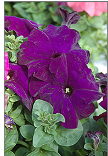
Dreams Midnight Petunia flowers