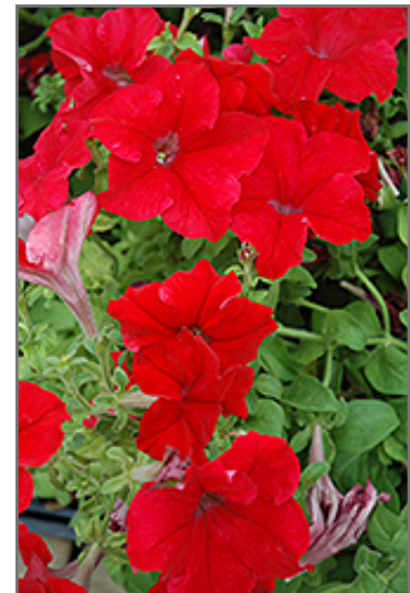
Dreams Red Petunia flowers