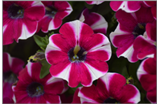
Cascadias Bicolor Cabernet Petunia flowers