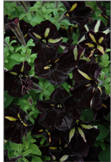
Phantom Petunia flowers