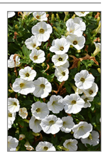
Piccola White Petunia flowers

Piccola White Petunia will grow to be about 18 inches tall at maturity, with a spread of 10 inches. When grown in masses or used as a bedding plant, individual plants should be spaced approximately 8 inches apart. Its foliage tends to remain dense right to the ground, not requiring facer plants in front. This fast-growing annual will normally live for one full growing season, needing replacement the following year.