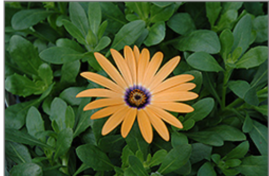
Orange Symphony African Daisy flowers