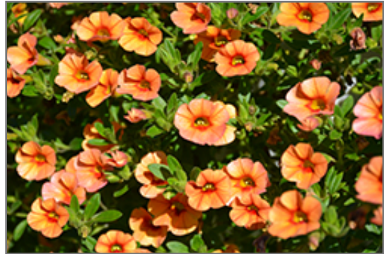
Can-Can Apricot Calibrachoa flowers