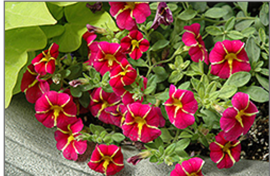
Superbells Cherry Star Calibrachoa flowers

Superbells Cherry Star Calibrachoa will grow to be about 10 inches tall at maturity, with a spread of 24 inches. When grown in masses or used as a bedding plant, individual plants should be spaced approximately 12 inches apart. Its foliage tends to remain low and dense right to the ground. This fast-growing annual will normally live for one full growing season, needing replacement the following year.