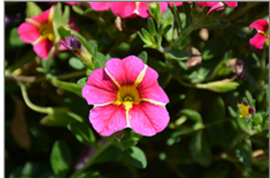
Superbells Cherry Star Calibrachoa flowers

This plant will require occasional maintenance and upkeep. Trim off the flower heads after they fade and die to encourage more blooms late into the season. It is a good choice for attracting bees and hummingbirds to your yard, but is not particularly attractive to deer who tend to leave it alone in favor of tastier treats. It has no significant negative characteristics.