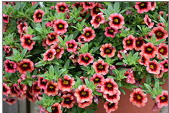
Superbells Coralberry Punch Calibrachoa flowers