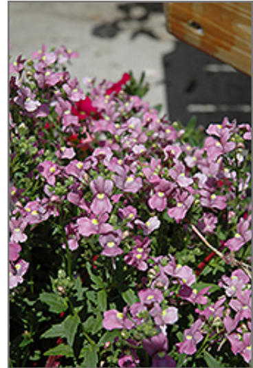
Compact Pink Innocence Nemesia flowers

Compact Pink Innocence Nemesia will grow to be about 12 inches tall at maturity, with a spread of 10 inches. When grown in masses or used as a bedding plant, individual plants should be spaced approximately 6 inches apart. Its foliage tends to remain dense right to the ground, not requiring facer plants in front. This fast-growing annual will normally live for one full growing season, needing replacement the following year.