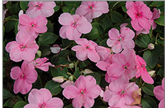
Super Elfin XP Pink Impatiens flowers