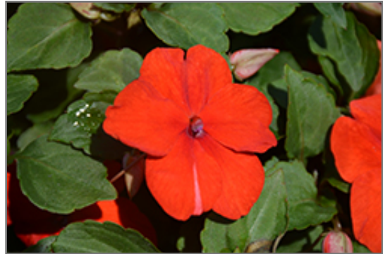
Super Elfin XP Scarlet Impatiens flowers