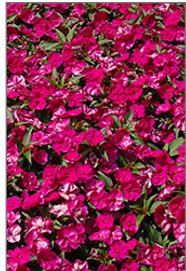
Fanfare Fuchsia Impatiens flowers