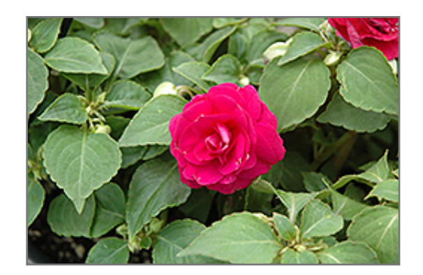
Fiesta Burgundy Double Impatiens flowers