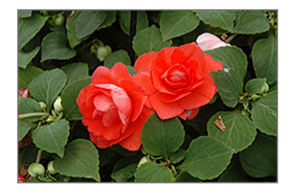
Fiesta Ole Salmon Double Impatiens flowers