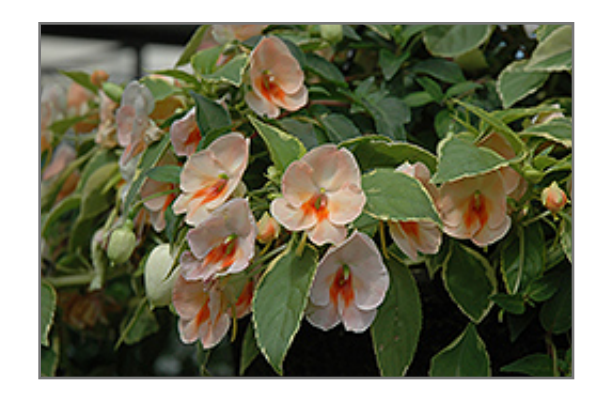
Fusion Peach Frost Impatiens flowers