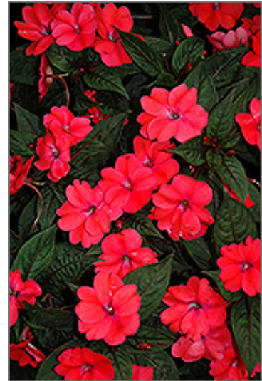
SunPatiens Compact Deep Rose New Guinea Impatiens flowers

SunPatiens Compact Deep Rose New Guinea Impatiens is recommended for the following landscape applications;