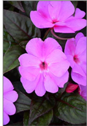
Divine Lavender New Guinea Impatiens flowers