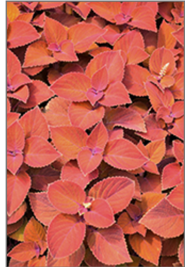
ColorBlaze Sedona Sunset Coleus foliage