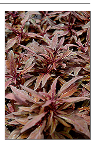
ColorBlaze Velvet Mocha Coleus foliage

ColorBlaze Velvet Mocha Coleus will grow to be about 3 feet tall at maturity, with a spread of 24 inches. When grown in masses or used as a bedding plant, individual plants should be spaced approximately 20 inches apart. Although it's not a true annual, this fast-growing plant can be expected to behave as an annual in our climate if left outdoors over the winter, usually needing replacement the following year. As such, gardeners should take into consideration that it will perform differently than it would in its native habitat.