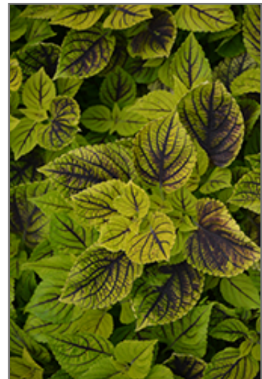
Gays Delight Coleus foliage