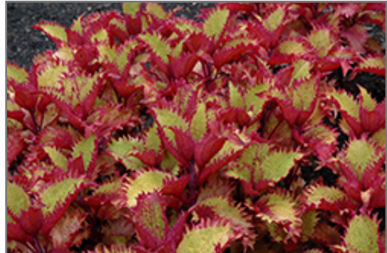
Henna Coleus foliage