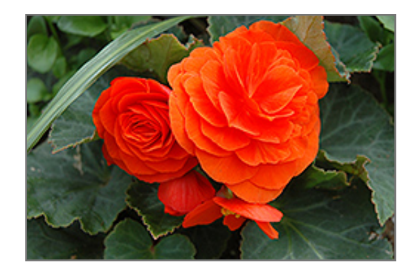
Nonstop Golden Orange Begonia flowers