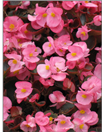
Bada Boom Pink Begonia flowers

Bada Boom Pink Begonia is recommended for the following landscape applications;