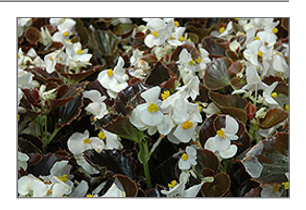
Harmony White Begonia flowers