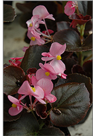
Cocktail Gin Begonia flowers

Cocktail Gin Begonia is recommended for the following landscape applications;