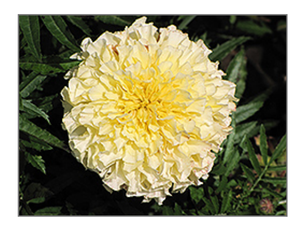
Vanilla Marigold flowers

17999 WCR 4 Brighton, CO, 80603 phone: 303-775-9629 www.incolorme.com