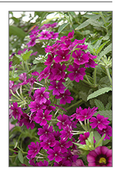
Empress Violet Blue Verbena flowers