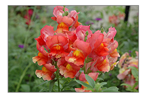
Liberty Classic Scarlet Snapdragon flowers