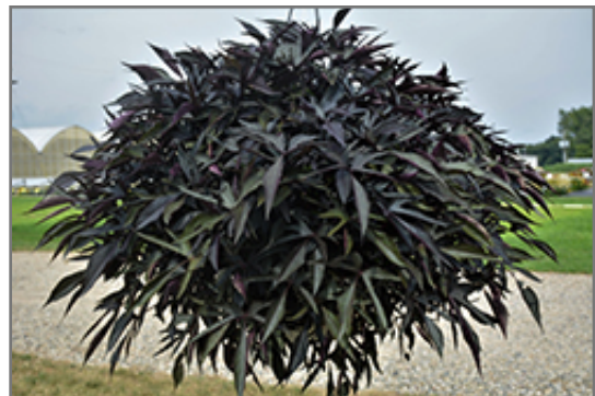
Illusion Midnight Lace Sweet Potato Vine