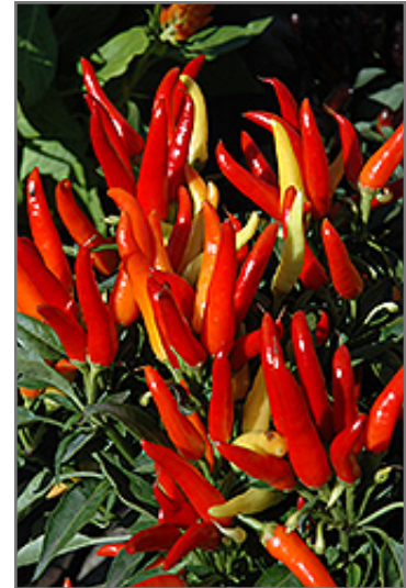
Chilly Chili Ornamental Pepper fruit

This plant will require occasional maintenance and upkeep, and should not require much pruning, except when necessary, such as to remove dieback. Deer don't particularly care for this plant and will usually leave it alone in favor of tastier treats. It has no significant negative characteristics.