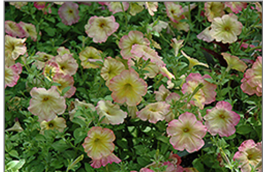
Debonair Dusty Rose Petunia flowers