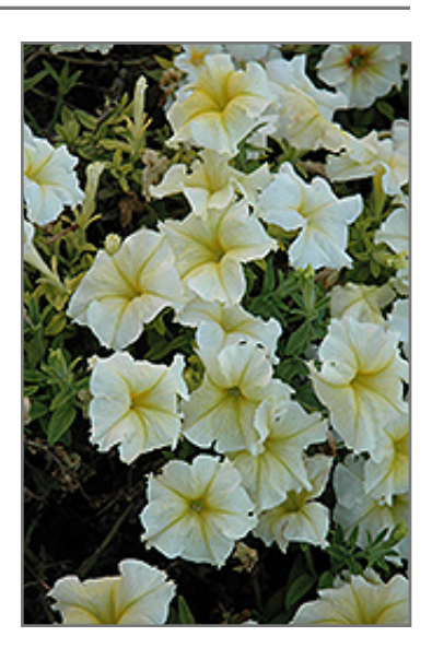
Paparazzi Glitz Yellow Petunia flowers

Paparazzi Glitz Yellow Petunia will grow to be about 12 inches tall at maturity, with a spread of 14 inches. When grown in masses or used as a bedding plant, individual plants should be spaced approximately 12 inches apart. Its foliage tends to remain dense right to the ground, not requiring facer plants in front. This fast-growing annual will normally live for one full growing season, needing replacement the following year.