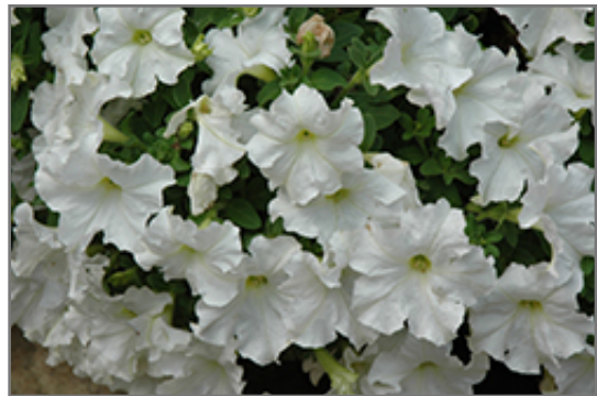
Pretty Flora White Petunia flowers