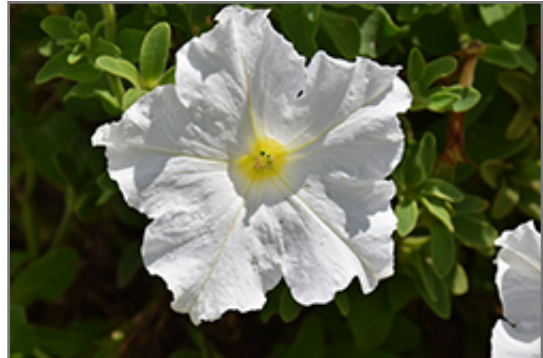
Pretty Flora White Petunia flowers