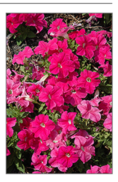
Pretty Grand Deep Pink Petunia flowers

Pretty Grand Deep Pink Petunia will grow to be about 8 inches tall at maturity, with a spread of 12 inches. When grown in masses or used as a bedding plant, individual plants should be spaced approximately 10 inches apart. Its foliage tends to remain low and dense right to the ground. This fast-growing annual will normally live for one full growing season, needing replacement the following year.