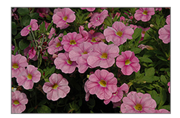
Aloha Soft Pink Calibrachoa flowers