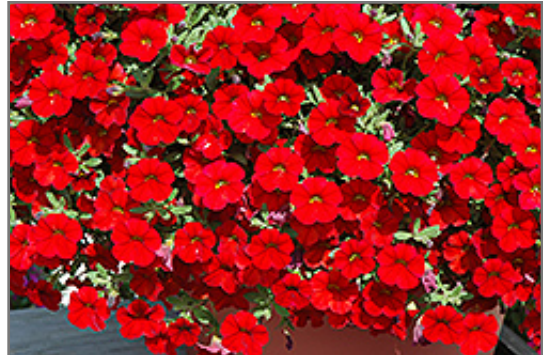
Cabaret Bright Red Calibrachoa flowers

Cabaret Bright Red Calibrachoa is recommended for the following landscape applications;