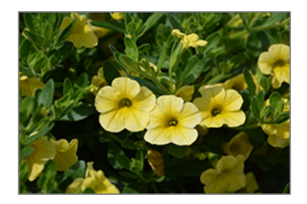
Caloha Lemon Calibrachoa flowers