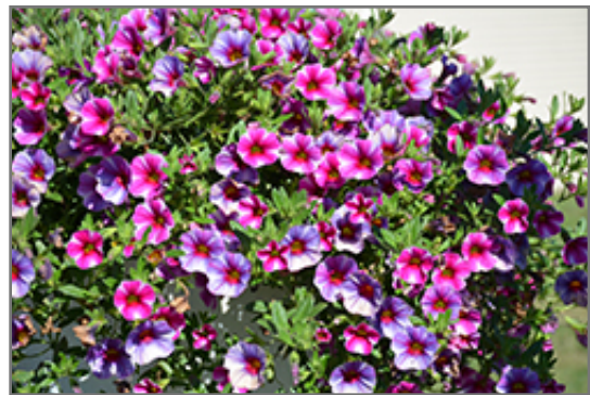
Can-Can Hot Pink Star Calibrachoa flowers