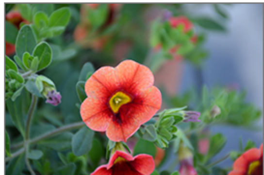
Celebration Mandarin Calibrachoa flowers