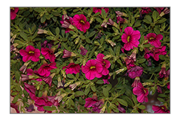
Million Bells Cherry Pink Calibrachoa flowers